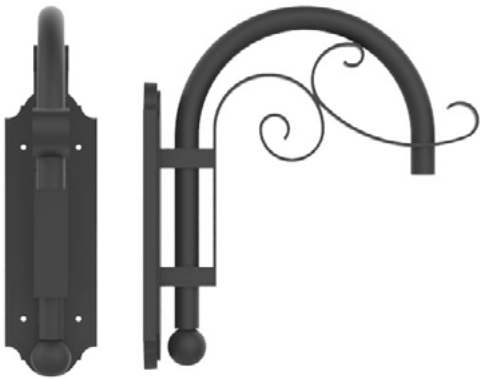
A17 Wall Mount Cast Wall Plate